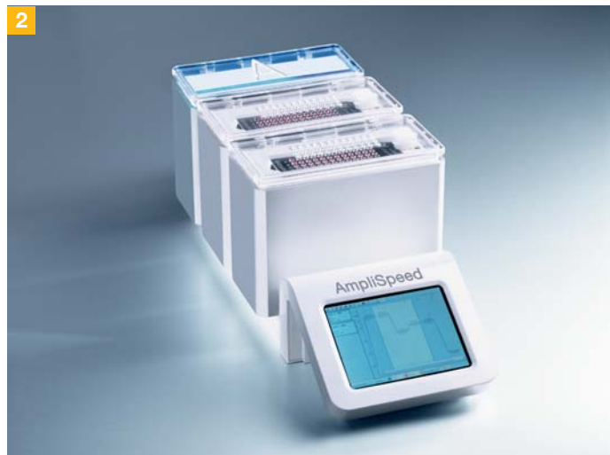
Figure 2: AmpliSpeed ASC200D slide cycler (Advalytix)

sealing solution and merges with the lysis mixture placed on the reaction site. The loaded AmpliGrid was transferred to the AmpliSpeed slide cycler and the PCR programme was started according to table E. After cycling the AmpliGrid was cooled down to room temperature.